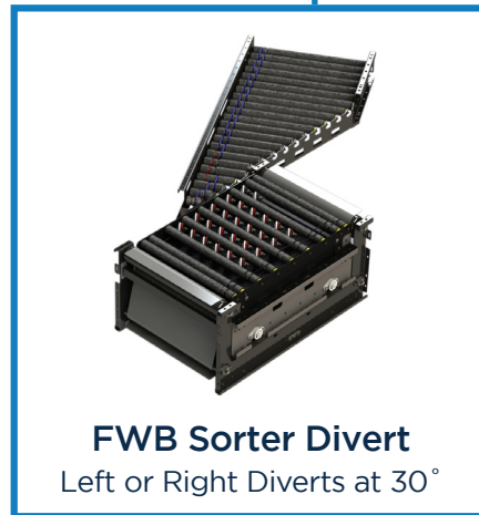
FWB Sorter Divert Left or Right Diverts at 30°