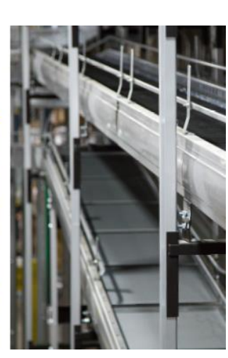
Customer Experience, powered by Trew<sup>®</sup>, is a valuable resource for all service needed after material handling system implementation.

With the material handling industry growing and consolidation occurring among OEMs in the industry, Trew saw an opportunity to provide integrators and end-users with a one-stop shop to obtain high quality material handling hardware, software, controls, electrical and service. The intent is that integrators and end users can come to Trew for any of their material handling needs, regardless of project size, and still have accessibility to all the tools necessary for uncommonly smart material handling solutions.